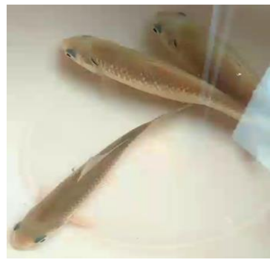
Bisphenol Probiotic + bisphenol Fig. 1. Coloration of the skin of the fish of the research groups

fish of group III, which were fed with probioticcontaining feed for 28 days: fish actively moved, effectively consumed feed; the color of their skin did not differ from the control group; increased mucus formation was not observed; atypical respiratory movements were not detected.